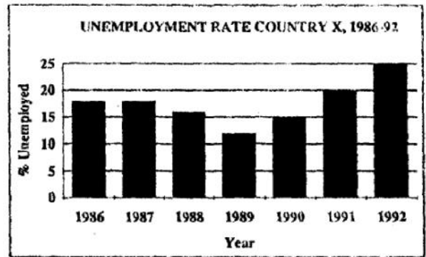
UNEMPLOYMENT RATE COUNTRY X, 1986 - 92

Items 26 - 27 refer to the diagram below.